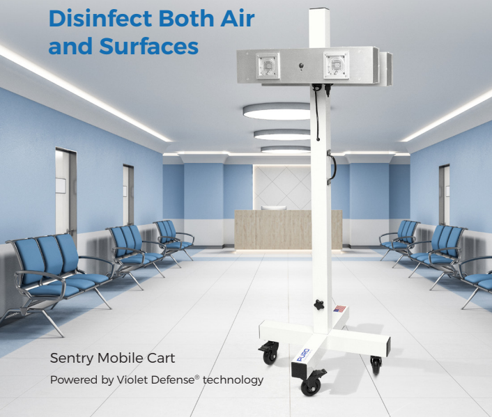
Sentry Mobile Cart