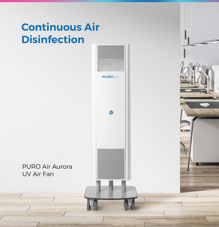
PURO Air Aurora UV Air Fan