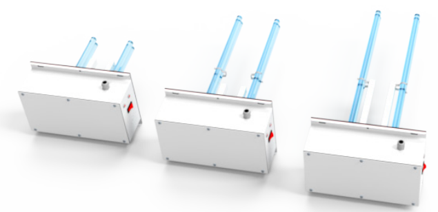
One Universal Unit, Three Lamp Options