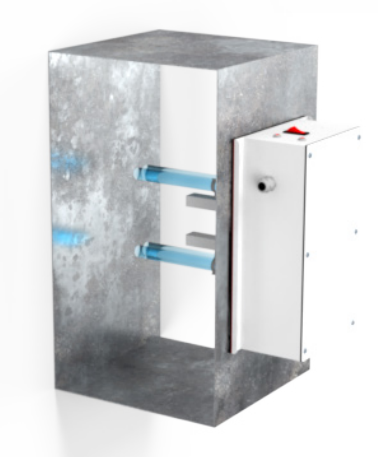
Application in AHU

Defender is made with high quality and extremely durable components and works perfectly in difficult operating conditions of high humidity, low temperatures, and more.