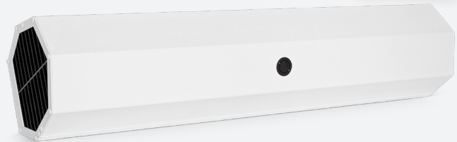
SURFACE MOUNT WHISPER

Excellent alternative to portable HEPA filtration devices as this uses high-wattage UV to inactivate germs vs. catching them. Designed to be used to disinfect air in occupied spaces.